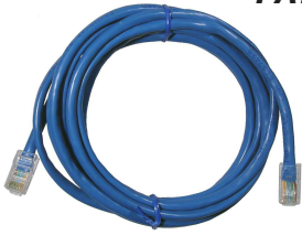
Category 5e patch cord.